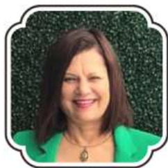
The Bennett Greenspon Leadership Award