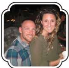
L'Dor V'dor Award (Next Generation Award)