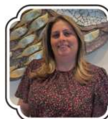
Ner Tamid Award (Igniting Young Minds Award)