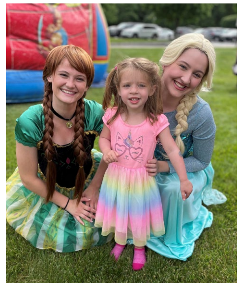
Pirates & Princesses Young Family Shabbat