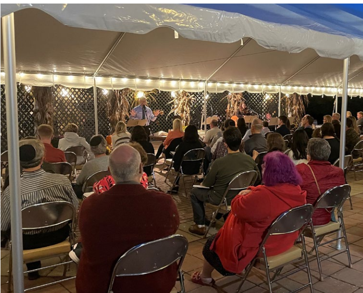
Outdoor Sukkot Worship