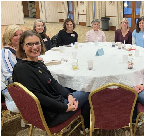
C4C Book Club