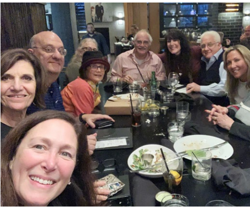
C4C Singles Club