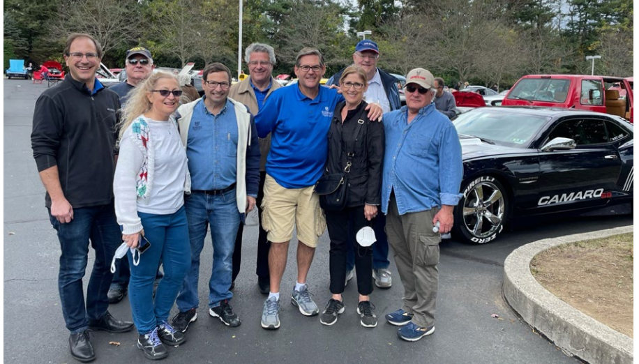
Brotherhood Car Show