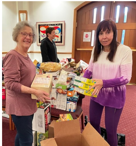
Ukrainian Refugees Collection Drive