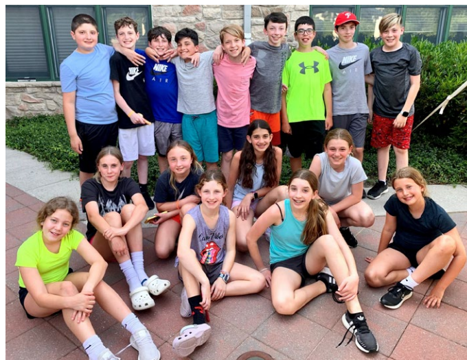
6th Grade Summer Send Off Event