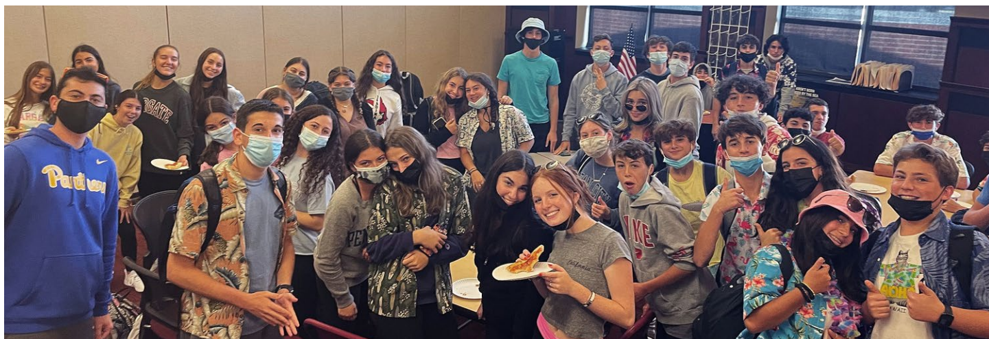
JSU at UDHS