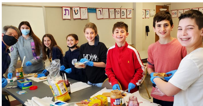
PB&J Mitzvah Project