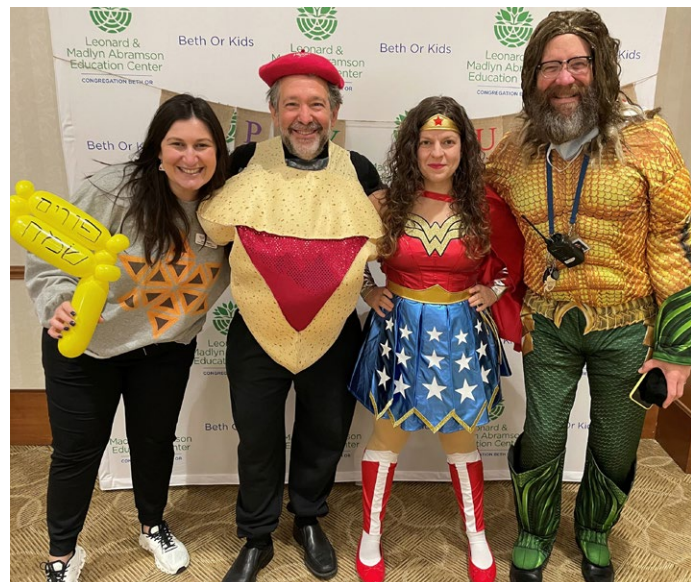
Staff at Jewperhero Purim