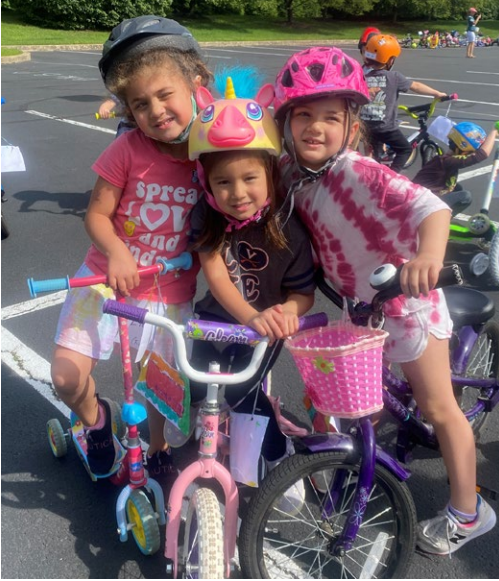
CECE Bike Day