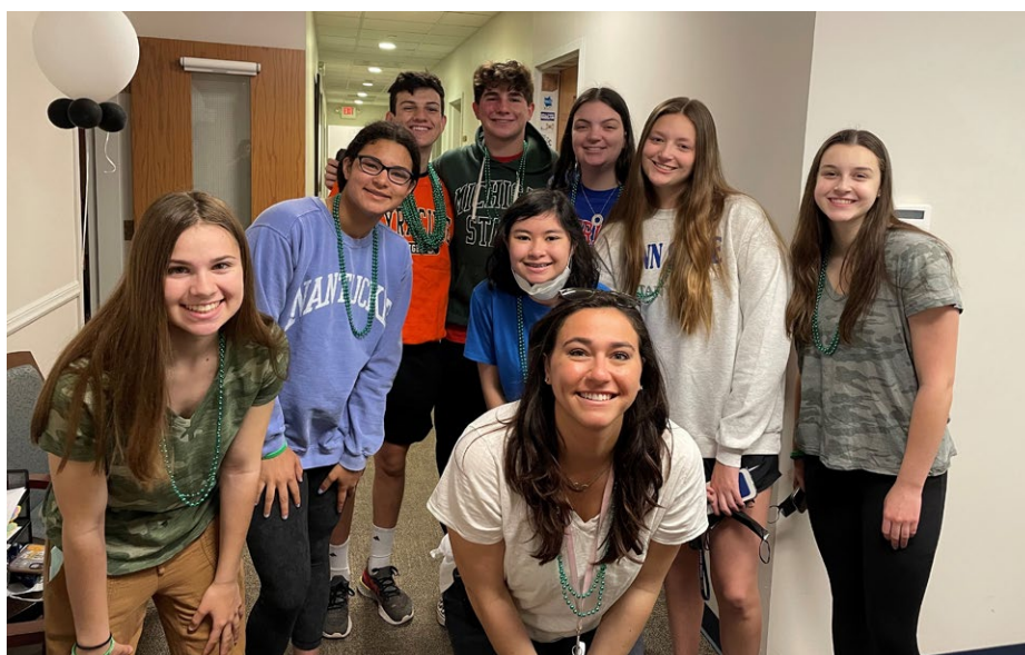
Religious School Madrichim