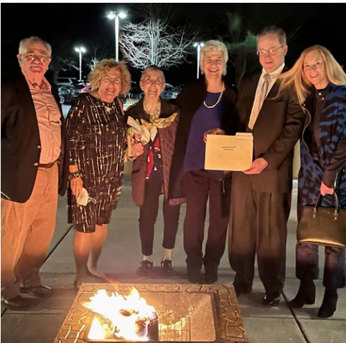
Past Presidents Burning the Mortgage