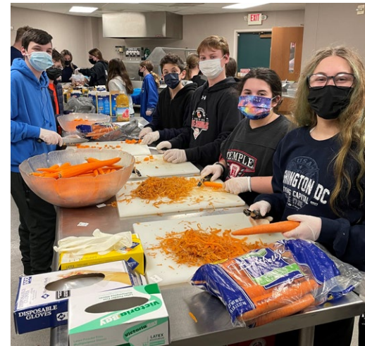
YOBO Cooks for Meals that Matter