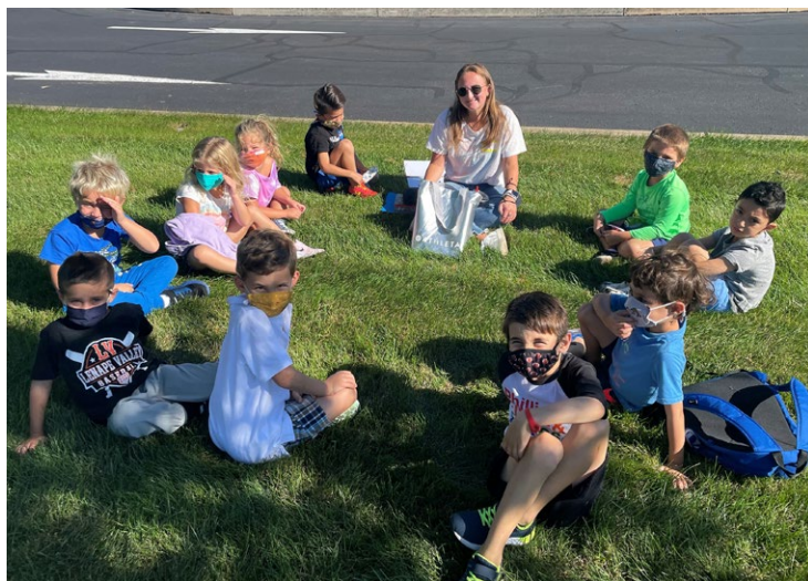
1st Day of Religious School 1st Grade Class