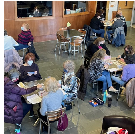
C4C Canasta Club