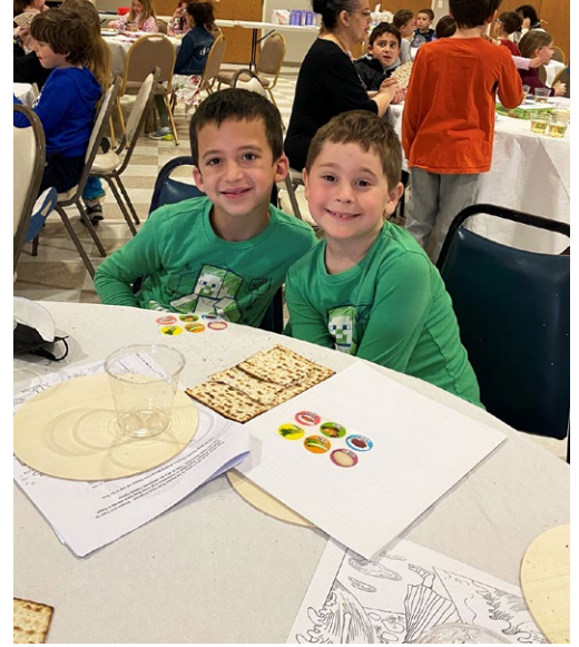
Religious School Model Seder