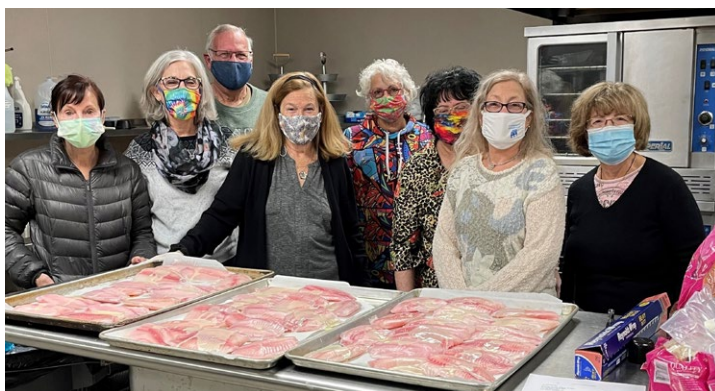
Meals that Matter