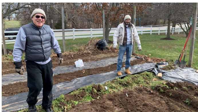
Corner of Our Land Garden Prep