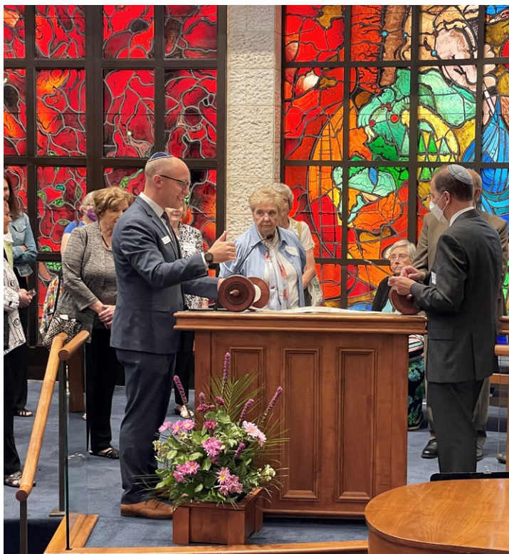
Ecumenical Luncheon and Program