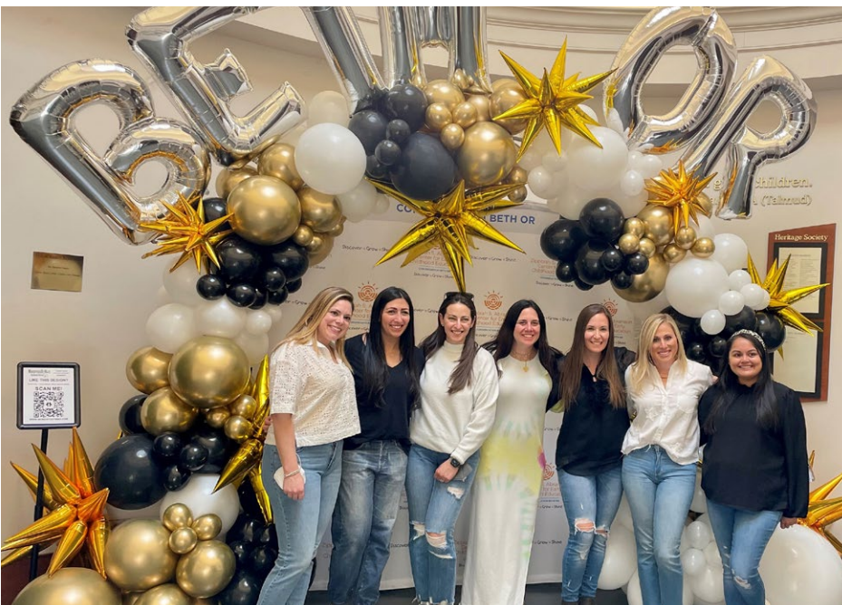
CECE Bingo Committee