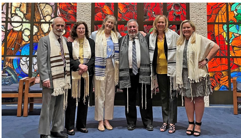
Adult B'nai Mitzvah