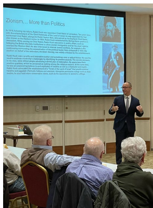
Beit Sefer Cafe