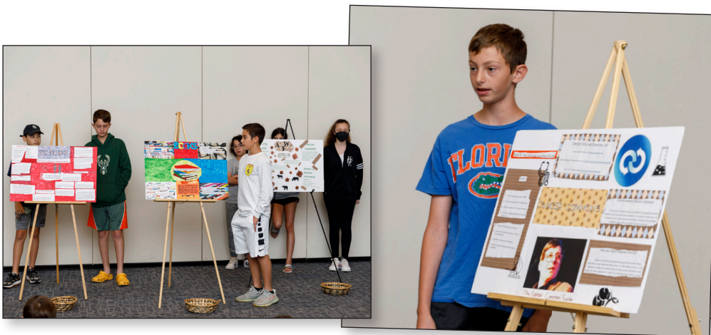
Photos from the 6th grade annual Tzedakah Fair.