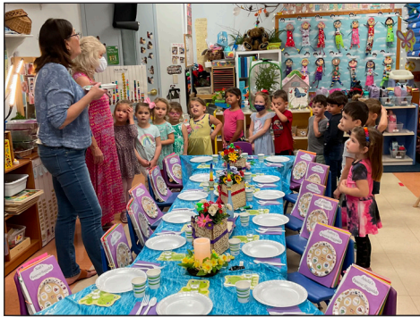
The Bears class prepares for their Seder.

Such activities supported the children's understanding of the Seders that the PK3 and PK4 children experienced in their classrooms. The One School teachers provided marvelous Passover activities and beautiful Seders.