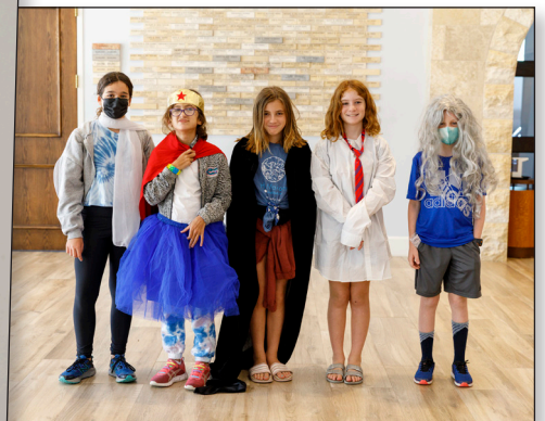
Photo from the 5th grade living museum.