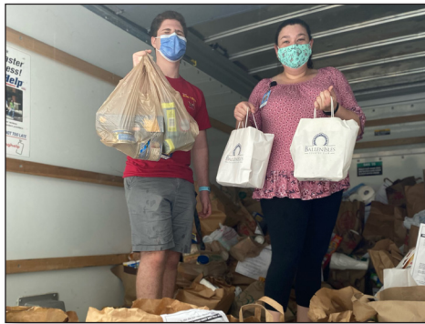
I loved coordinating our Simon Baker High Holy Days Food Drive every year!