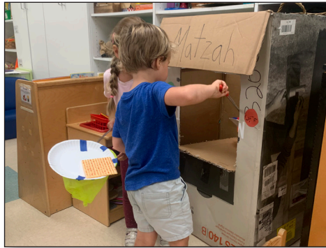
The Turtles class prepares matzah in their "matzah oven".