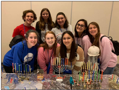
Celebrating Hanukkah with our high school teens at NFTY-STR Winter Regional in 2019.

And so, it is with a heavy heart that I am announcing that my last day at Temple Beth Am will be May 31. I will leave here knowing that I have given my all to our youth here at TBA and they gave it right back to me! I have such fond memories of my time and interactions with all of you that I will keep in my heart for years to come! Thank you all for welcoming me into the TBA community and I look forward to staying up to date with everyone!