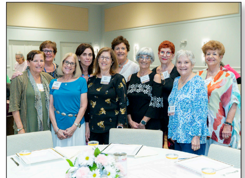
Photos from the Annual Sisterhood Luncheon on April 3.