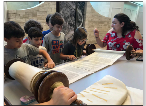
I always enjoyed being able to spend time in our HaMakom classes and teach.