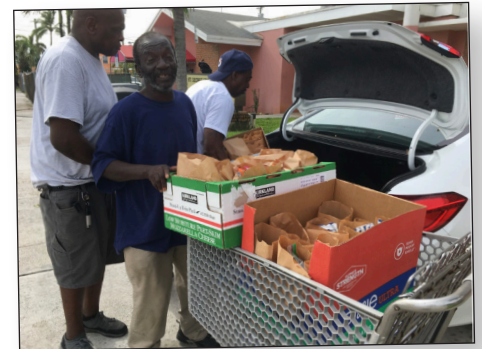
Men unloading lunch bags at St. George's Center.