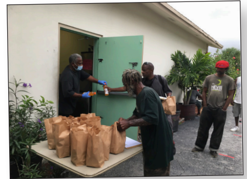
Guests receiving a hot breakfast and a bagged lunch at Extended Hands Community Outreach.

Unfortunately, the Coronavirus isn't going anywhere soon. I hope we can count on you in the future should the need arise.