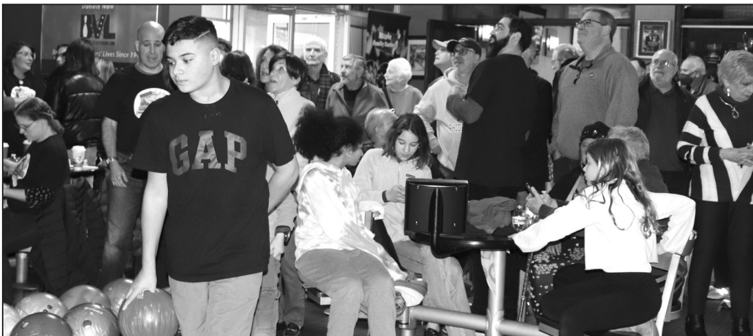
Congregants cheering on Super Bowl-a-Thon participants Sunday, February 12, at Maple Lanes.