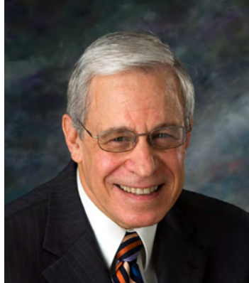
Member of Shir Ami