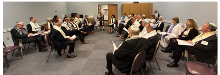
Past Presidents’ Torah Processional Kol Nidre 5784