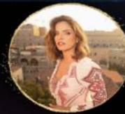
EMCEE NOA TISHBY SPECIAL ENVOY FOR ANTISEMITISM AND DELEGITIMIZATION