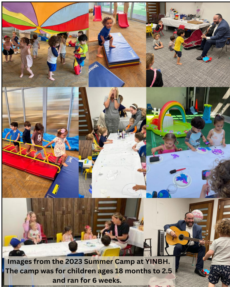
Images from the 2023 Summer Camp at YINBH. The camp was for children ages 18 months to 2.5 and ran for 6 weeks.

THANK YOU TO EVERYONE WHO HAS ALREADY RENEWED THEIR MEMBERSHIP FOR 5784