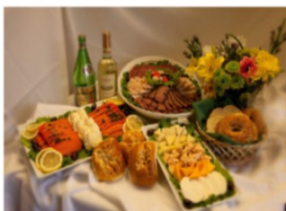
Exceptional Catering for all Occasions