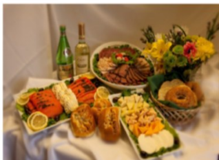
Exceptional Catering for all Occasions