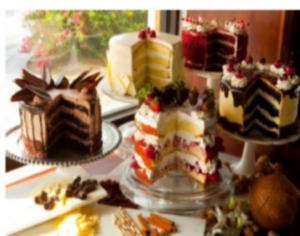
Over 45 years of Experience in Exceptional Food and Service