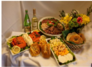
Exceptional Catering for all Occasions