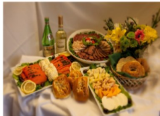
Exceptional Catering for all Occasions