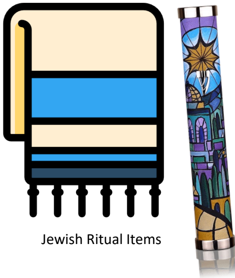
Jewish Ritual Items