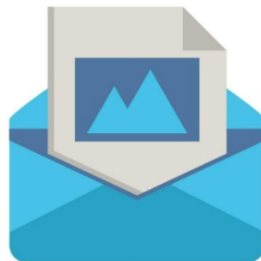
Greeting Cards and more!