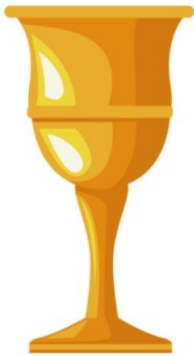
Shabbat & Holiday Items