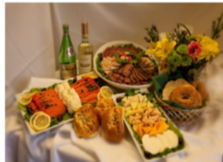
Exceptional Catering for all Occasions