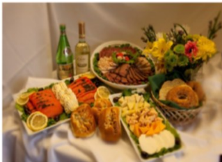
Exceptional Catering for all Occasions