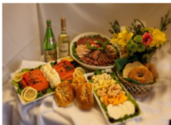
Exceptional Catering for all Occasions