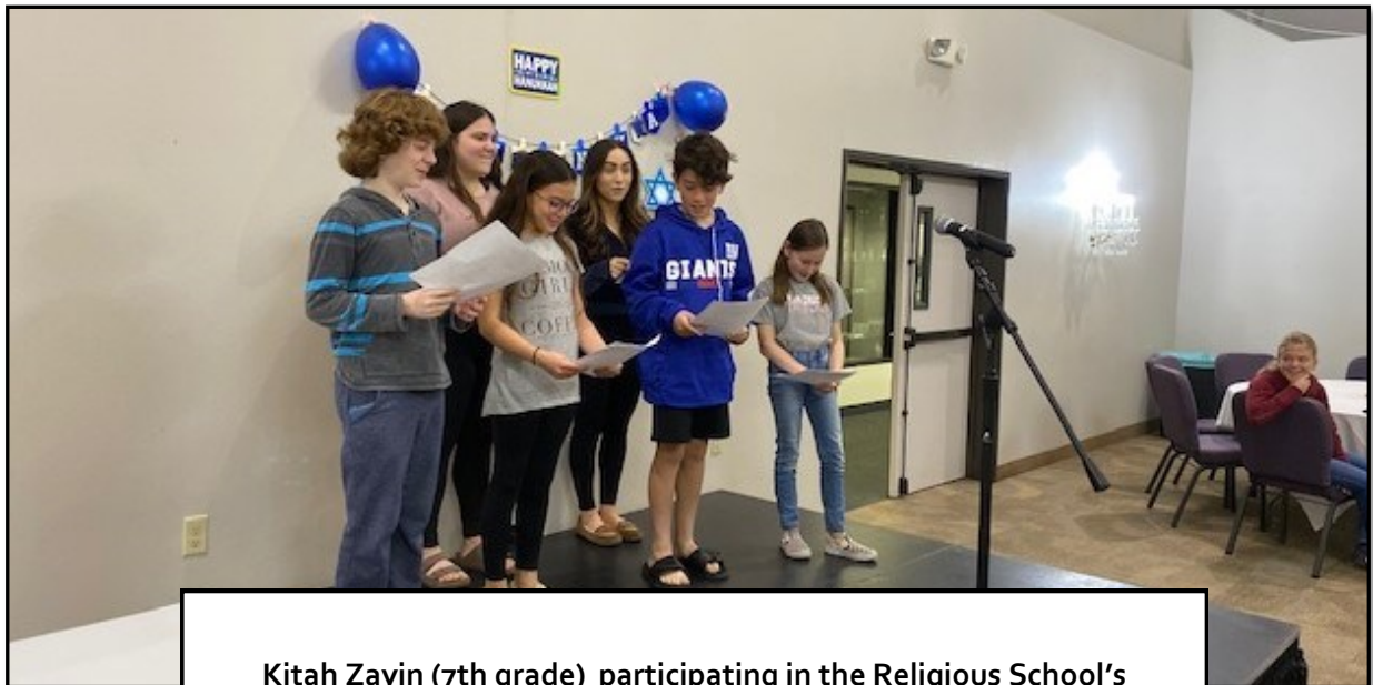
Kitah Zayin (7th grade) participating in the Religious School's Chanukah Program