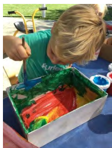
Creating a Sukkah