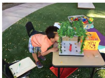
Checking out the sukkah