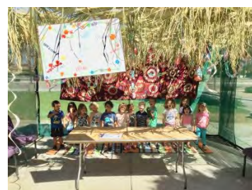
The sukkah at the temple