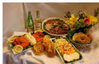
Exceptional Catering for all Occasions