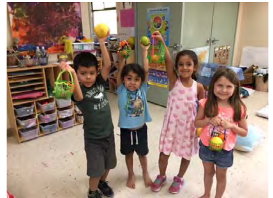
Gathering First Fruits