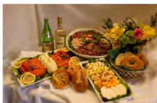
Exceptional Catering for all Occasions