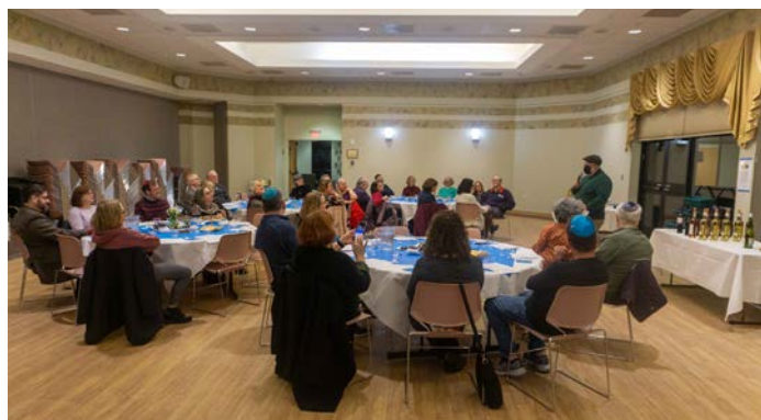
CBE's first-ever Tu B'Shevat seder