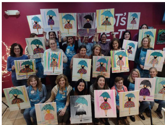
Sisterhood's many talented artists painted and sipped at Pinot's Palette in Herndon.