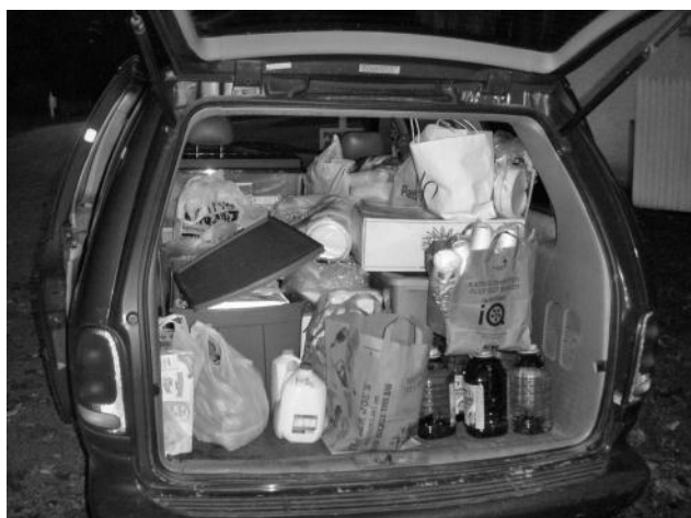
The minivan loaded with dishes from Beth Israel