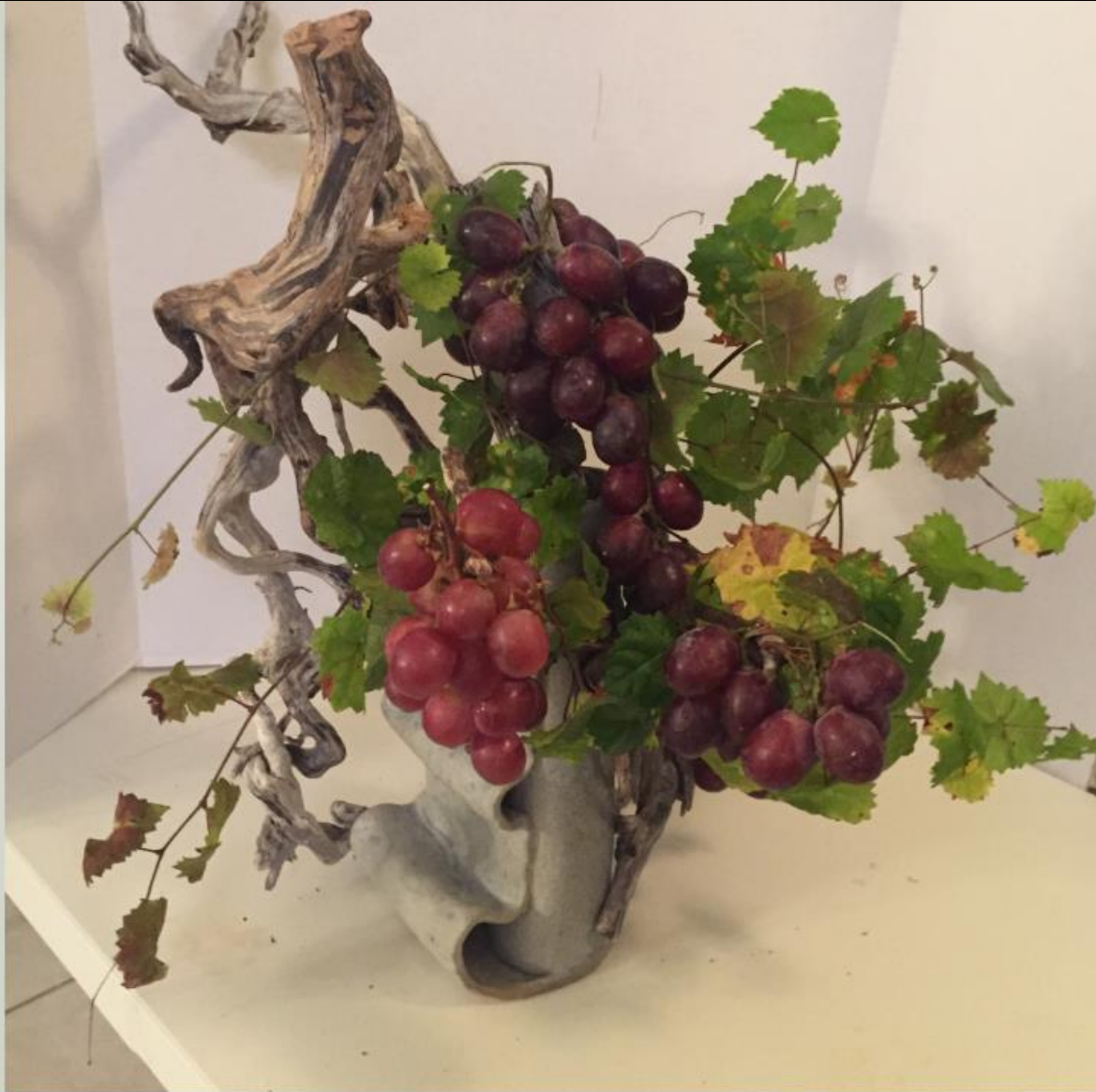
A Thanksgiving Arrangement