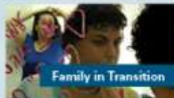
Family in Transition