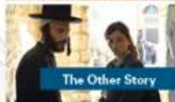
The Other Story