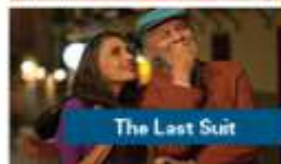
The Last Suit