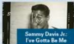
Sammy Davis Jr.: I've Gotta Be Me