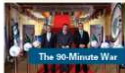
The 90-Minute War