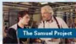
The Samuel Project