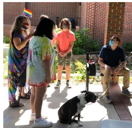
Pride Havdallah Event, June 2021

Wednesday mornings at 8:00 am (**7:45 am on Rosh Chodesh**)