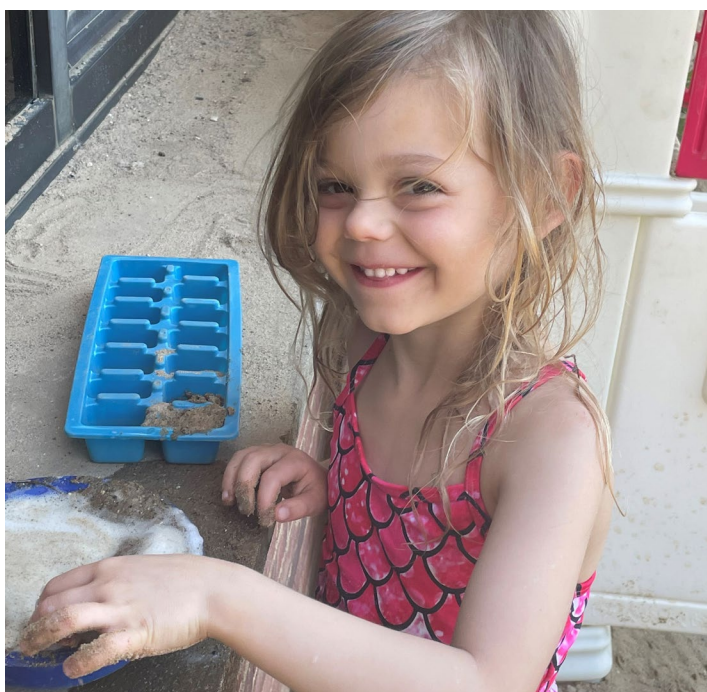
Children having fun at Camp Teva!