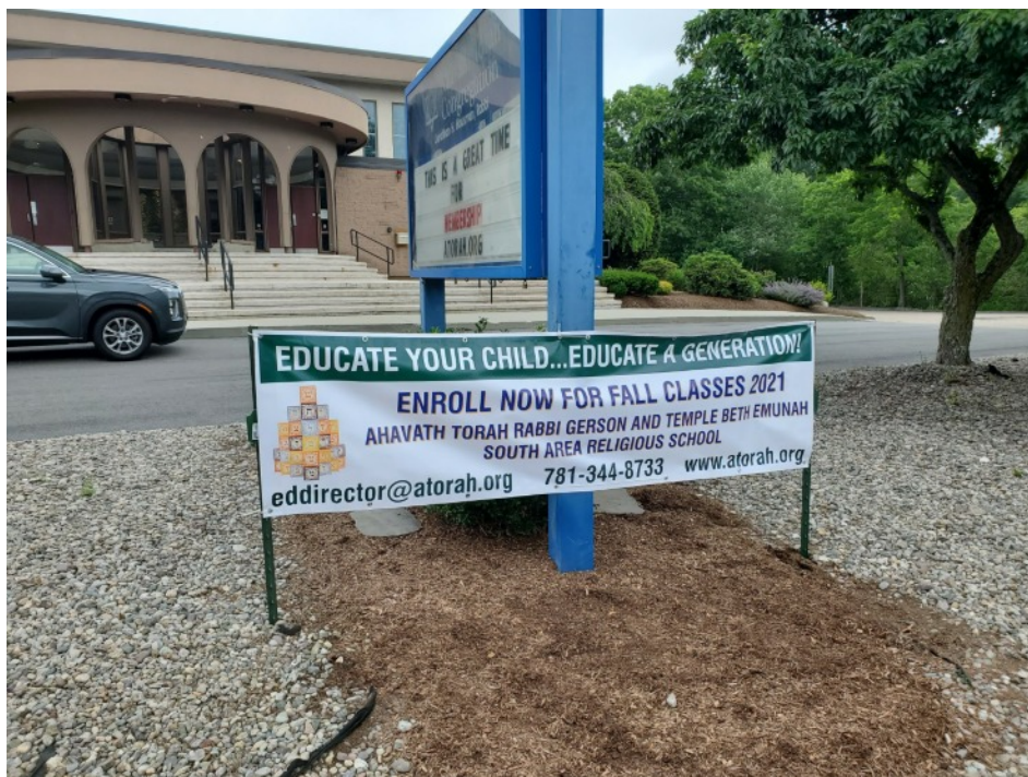
New Banner for our Religious School