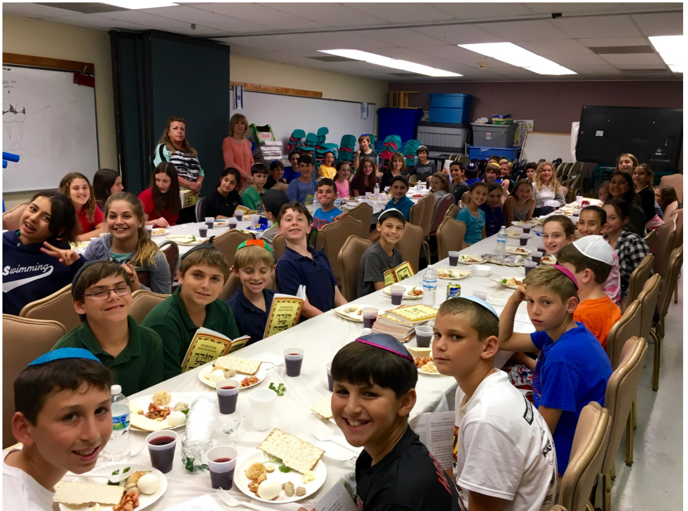
Religious School Model Seder