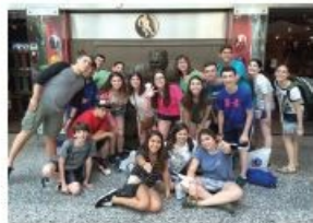
USY on Wheels, East June 27-July 24, 2017

With FUN , EXCITING , meaningful , immersive Jewish experiences for 7th & 8th graders