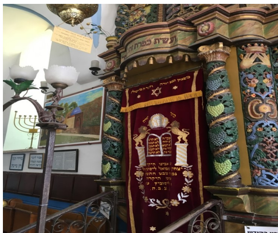
Ark inside the Ari Ashkenazi Synagogue in Sefad, Israel

This past June, my family and I travelled to Israel to visit my mother and to experience our Jewish homeland. This was my first trip to Israel, if you can believe it. We had been anticipating this trip for a couple of years; preparing for the journey of a lifetime. The flight was long, but quite uneventful. We arrived in a mostly asleep Jerusalem late on a Sunday evening and did not pull into our apartment rental in Netanya (a city of over 200,000 people located on the coast about 20 miles north of Tel Aviv) until sometime around 1:00 Monday