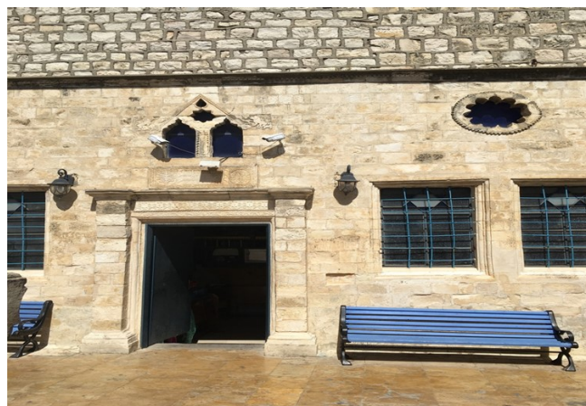
Entrance to the sanctuary of the Ari Ashkenazi Synagogue in Sefad