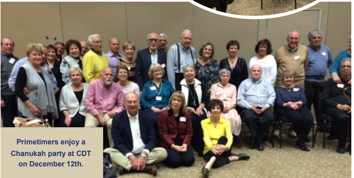
Primetimers enjoy a Chanukah party at CDT on December 12th.