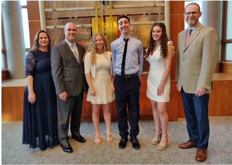
The 2019 Confirmation Class