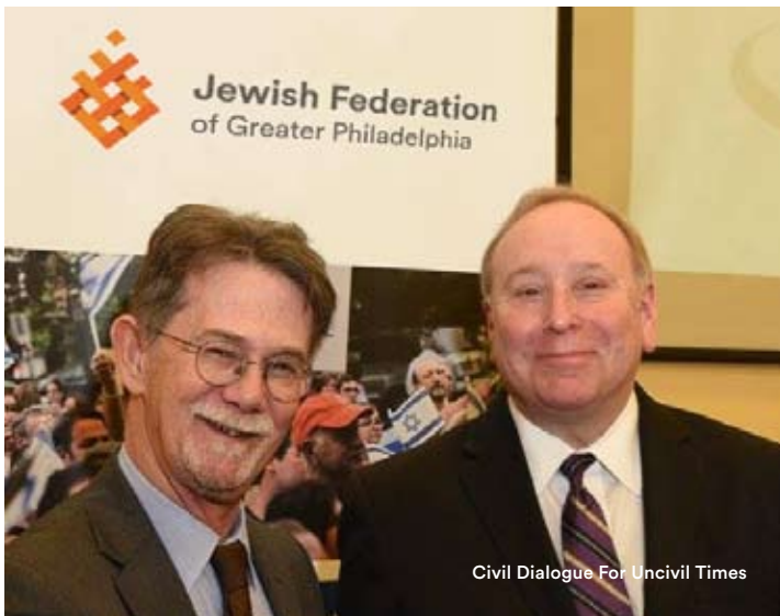
Civil Dialogue For Uncivil Times