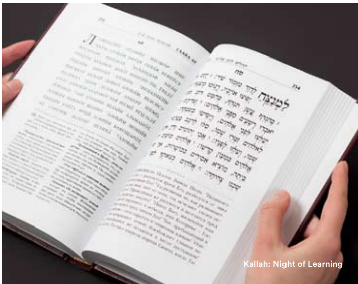
Kallah: Night of Learning