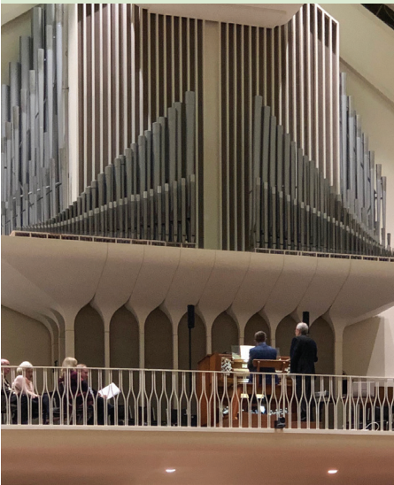
Concert attendees get a front row seat at NSCI's extraordinary Casavant Freres Organ for the concert on January 24, 2020.