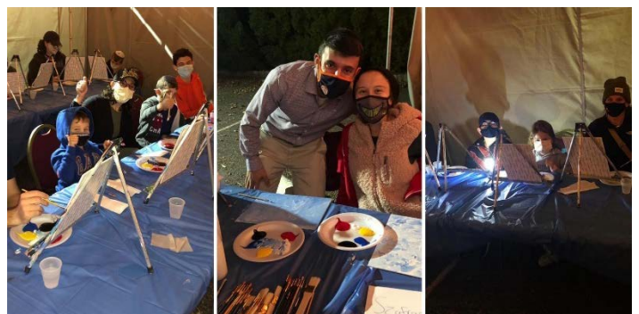
Family fun at the DFYD Sukkot Paint Night!