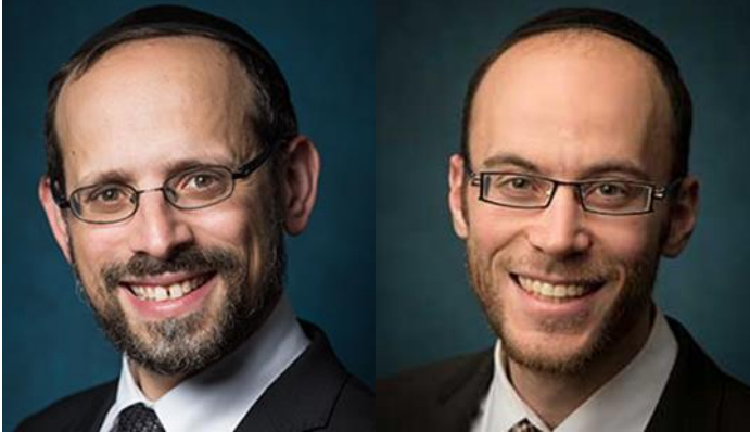
Rabbi Yaakov Werblowsky