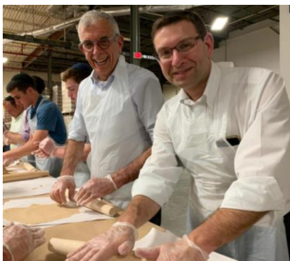
Father & Son Matza Baking