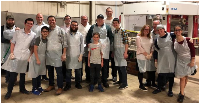
First Shift of CBY Matza Bakers