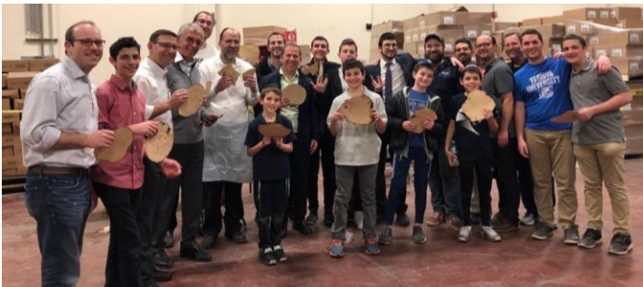
Second Shift of CBY Matza Bakers