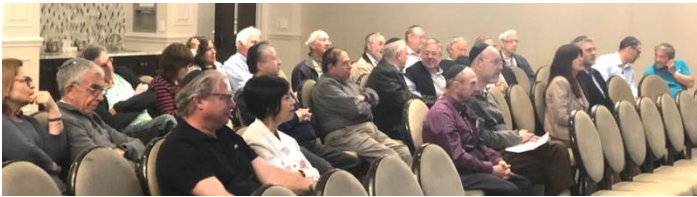
Some of the attendees at Tuesday's Annual Budget Meeting