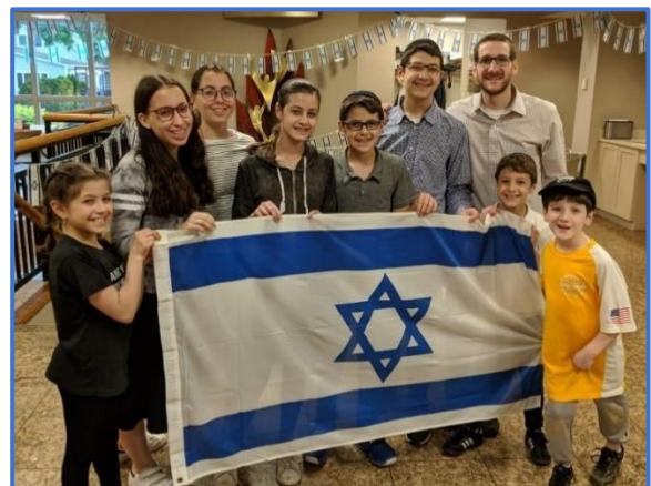
Decorating CBY for Yom Ha'atzmaut