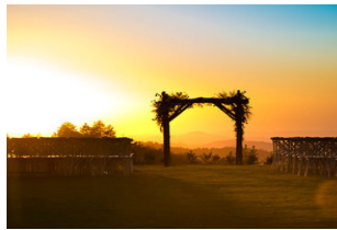
B) Chuppah Sunset