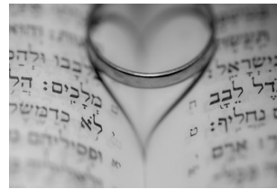
C) Siddur Ring