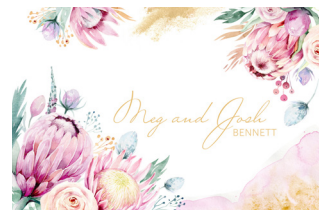
H) Personal Graphic