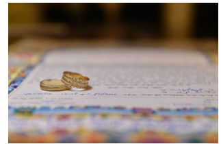
D) Ketubah Rings