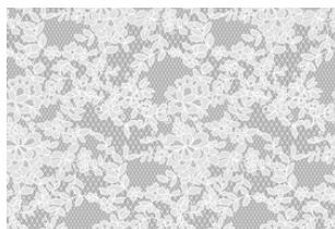
F) Lace Pattern