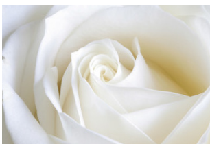
E) Rose Pattern