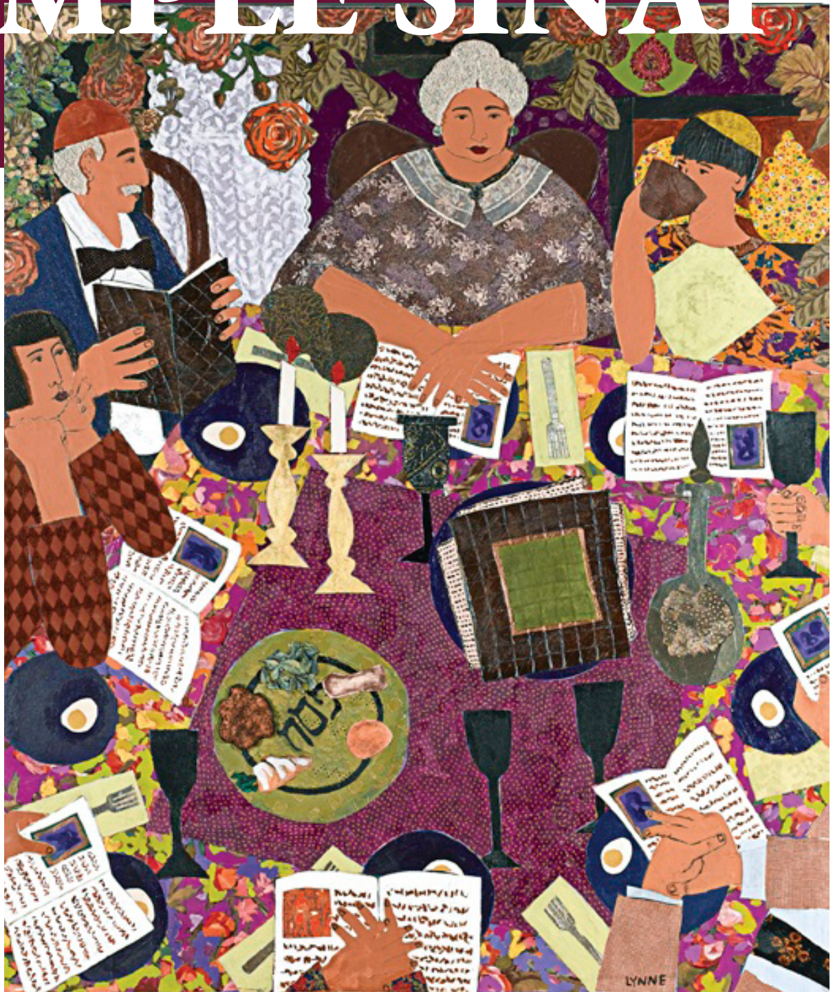
Cover Art by Lynne Feldman, more on page 7