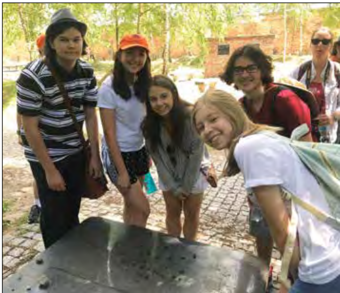
Some of our Shirley Barish Memorial Israel Experience teens pictured during the 2018 edition of the trip pictured in Warsaw, Poland.

We are pleased to announce that the Shirley Barish Memorial Israel Experience trip, which was postponed from Summer 2020, has been rescheduled for June 16 – July 13, 2021 . Students who are currently in 10th, 11th, and 12th grades will be eligible to spend a week