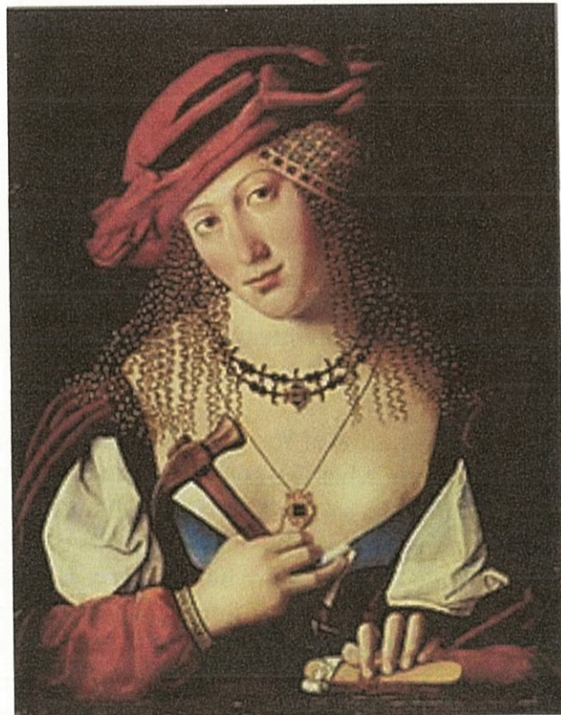
Jael (Dressed as a Venetian aristocrat) around 1500, by Bartolomeo Veneto

At her feet he sunk, he fell, he lay; At her feet he sunk, he fell; Where he sunk, there he fell down dead.