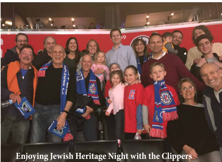
Enjoying Jewish Heritage Night with the Clippers