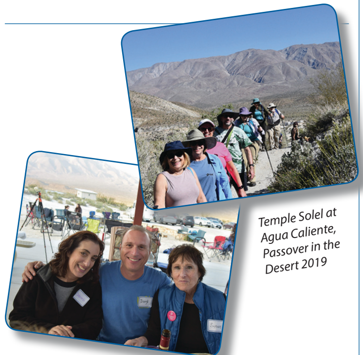
Temple Solel at Agua Caliente, Passover in the Desert 2019

Join us as the Adult B'nai Mitzvah class is called to the Torah and leads Shabbat Services for the entire congregation.