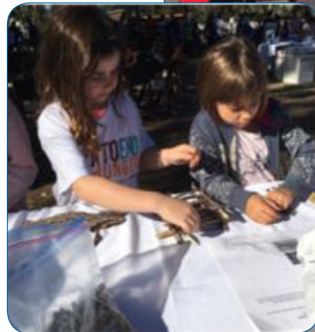
The Temple Solel religious school participated in the "Mazon Walk to End Hunger" at the Coastal Roots Farm, Encinitas.