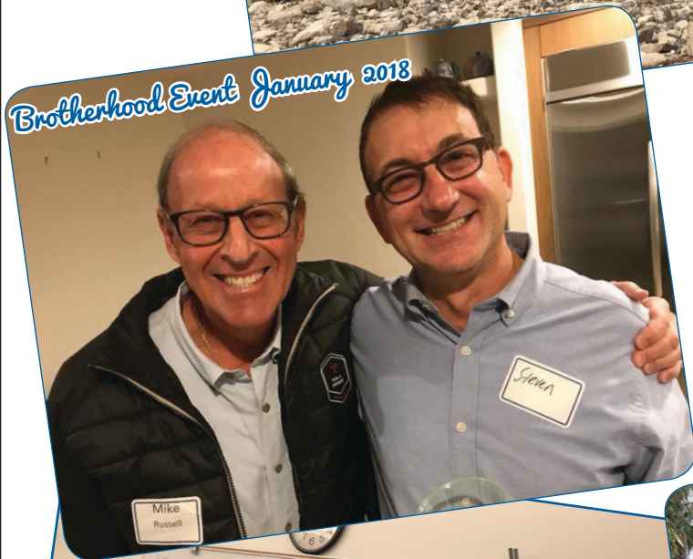
Brotherhood Event January 2018