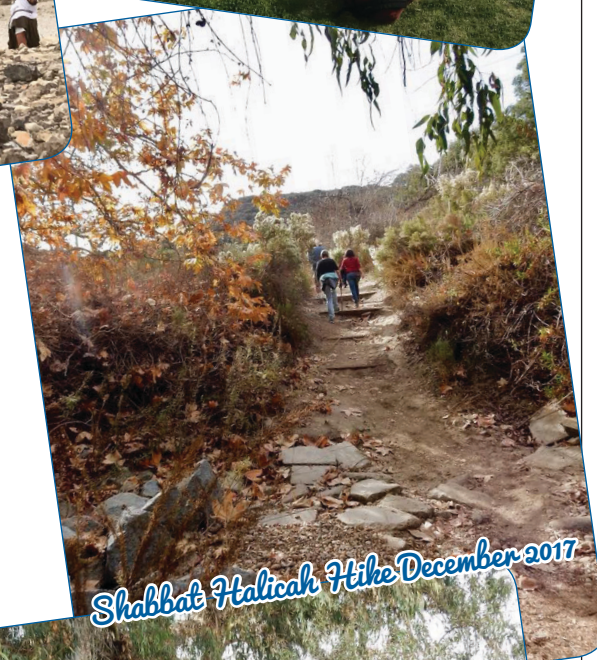
Shabbat Halicah Hike December 2017