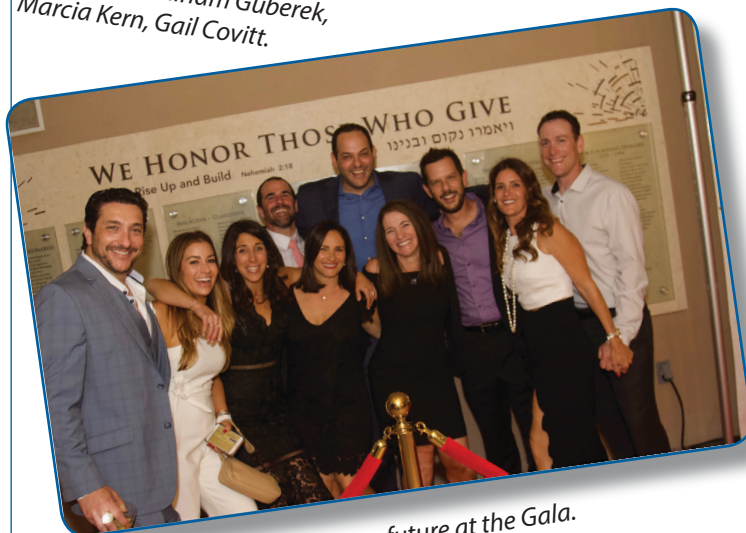
ECC Families celebrating our future at the Gala.