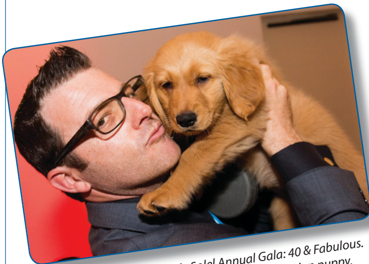
Temple Solel Annual Gala: 40 & Fabulous. Cantor Tiep and Live Auction puppy.