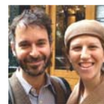
Carmiya & Michael Weinraub Young Leadership Award