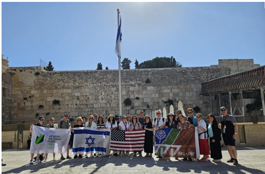
Shabbat Shalom from Jerusalem