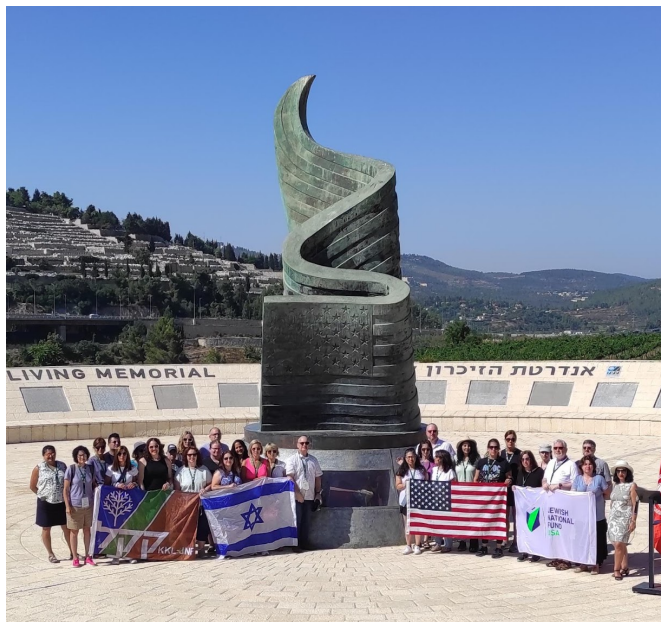
At the 9/11 Living Memorial outside of Jerusalem