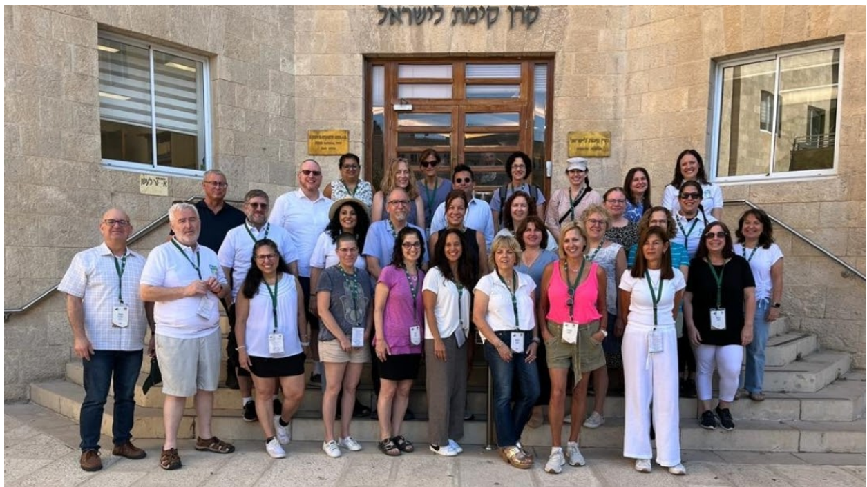
Last group photo at KKL-JNF offices in Jerusalem.