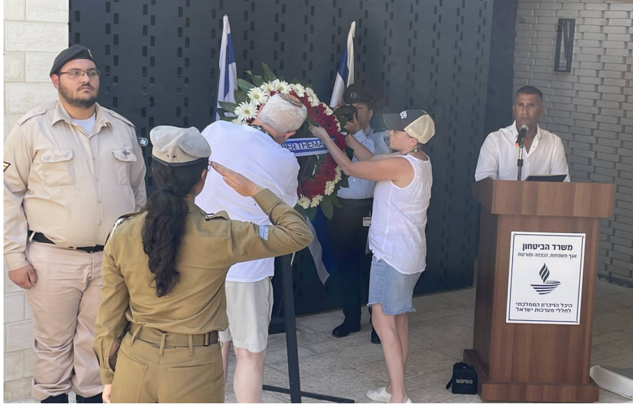
Placing a wreath at Mount Herzl's National Hall for Israel's Fallen