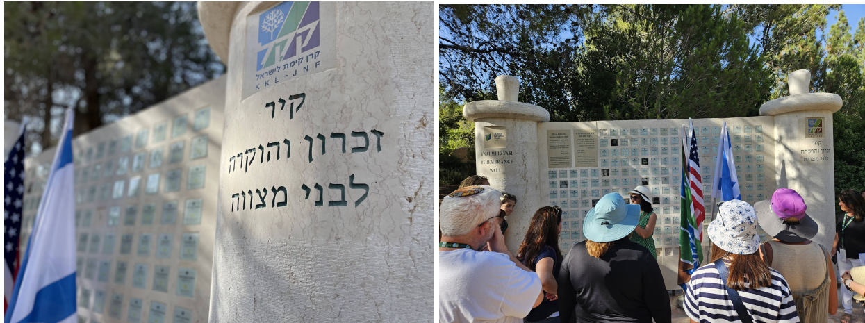
At the B'nai Mitzvah Remembrance Wall at Ness Harim