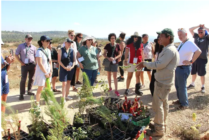
Planting Trees in Golani Junction