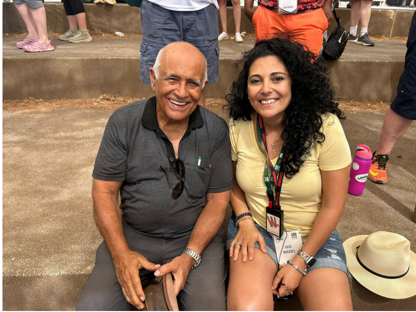
With Brigadier General (res.) Avigdor Kahalani