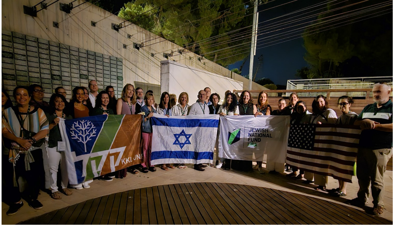
At ammunition Hill