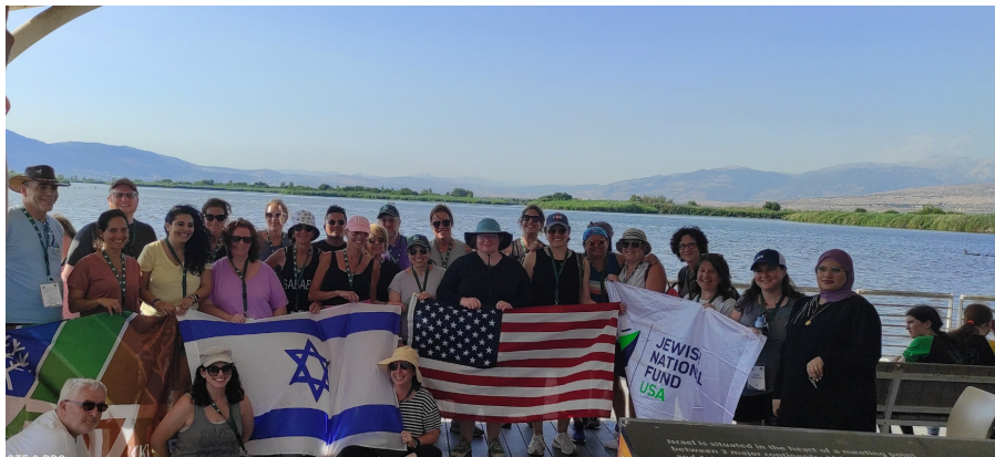
At Agamun Ha-Hula