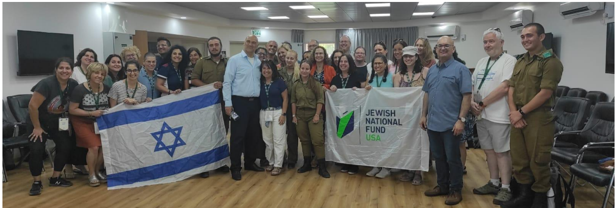
With IDF Education Unit Brigadier General Ophir Levius & Lt. Col. (res.) Tiran Attia