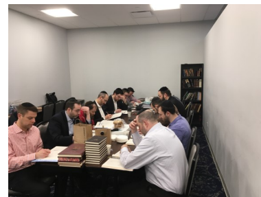
Kinyan Hamasechta Chicago