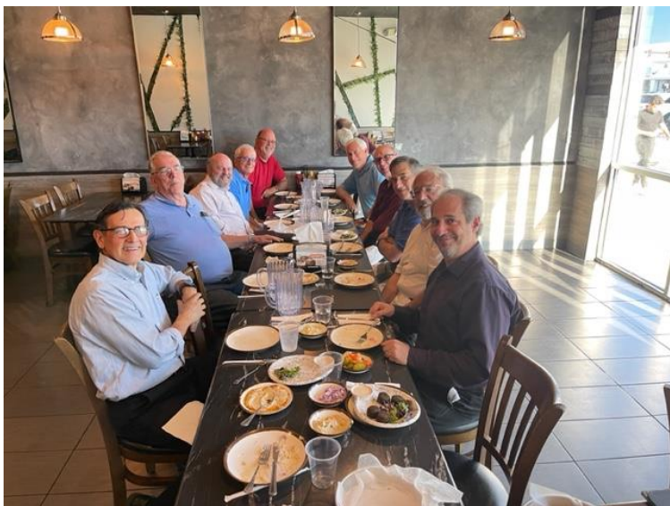
Enjoying dinner and conversation