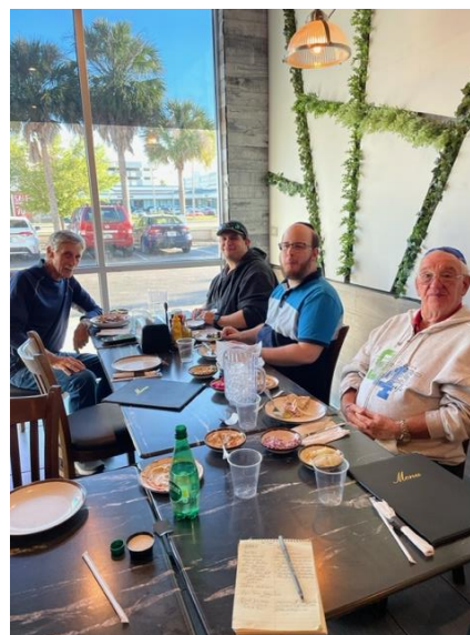
New and old COS members