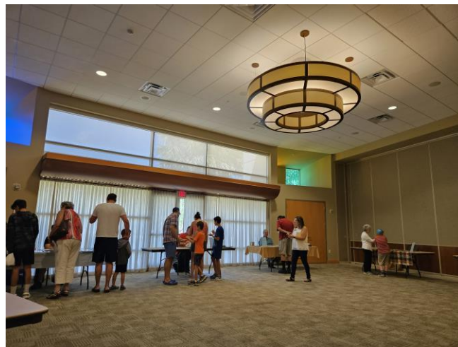
Collectibles Program attendees